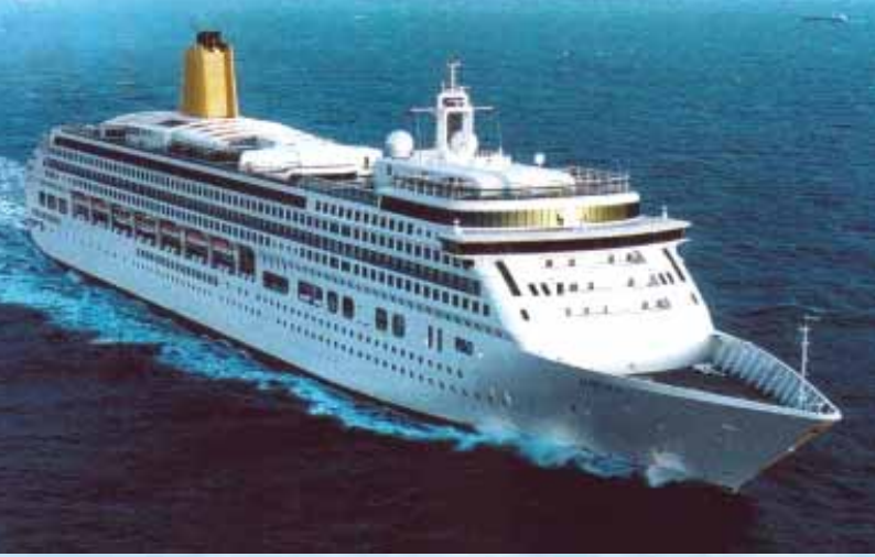
Cruise liner driven by 21,000 kW variable speed synchronous motors