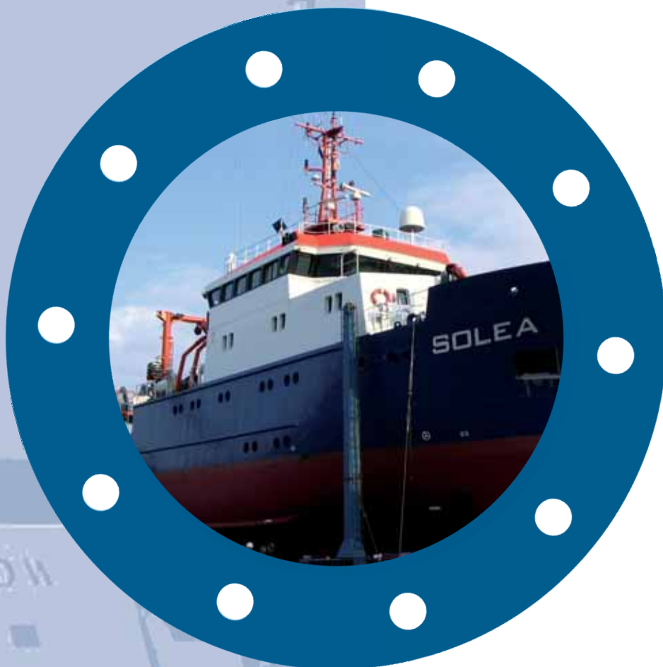
Fishing-research vessel „Solea“ driven by 950 kW DC-motor