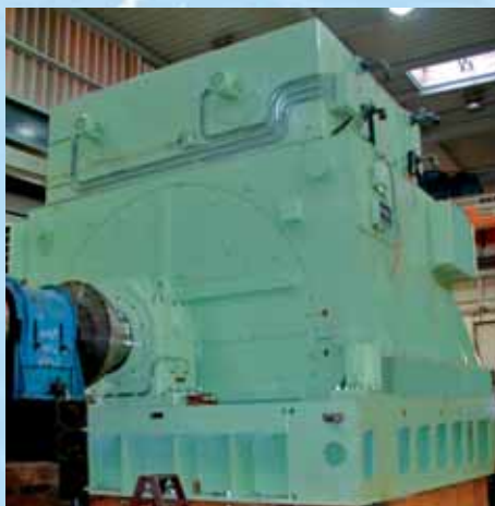
Variable speed synchronous motor for a cruise liner

Our product range guarantees the highest degree of equipment safety due to the machines' extreme reliability, their state-of-the-art design, and LDW's century of experience.